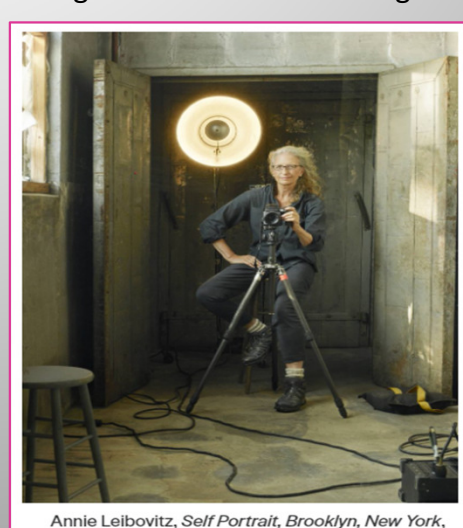
Annie Leibovitz, Self Portrait, Brooklyn, New York 2017.