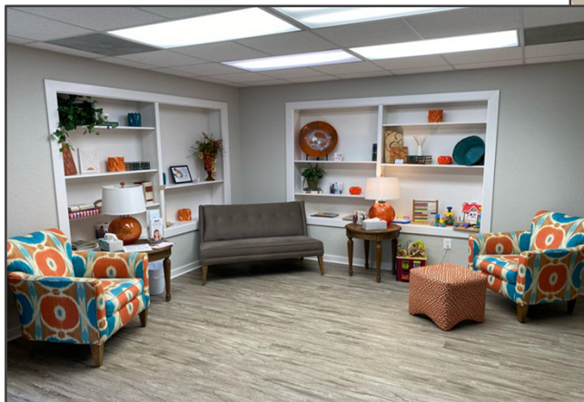
Test Center Waiting Room