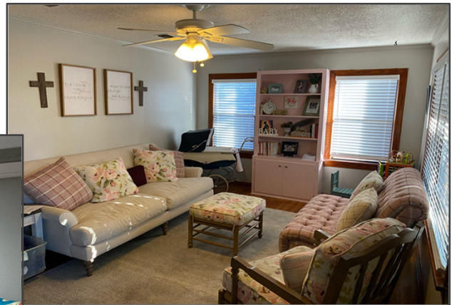
Resource Center Living Room